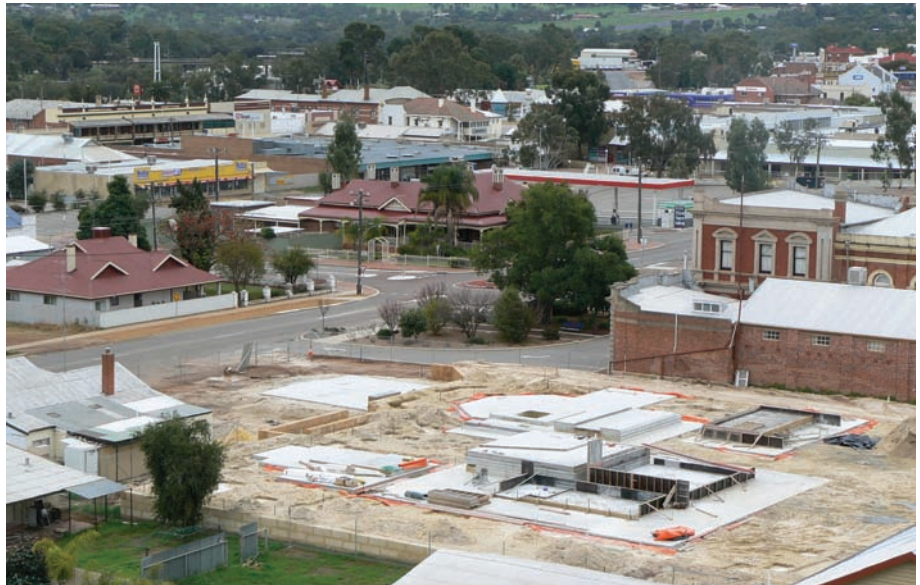
A bird's eye view of the building site

Work has been progressing steadily on the Bridgeley Community Centre. Thirty- nine of the forty - three tilt up panels required have now been made, and the remaining four should be completed in the next couple of days.