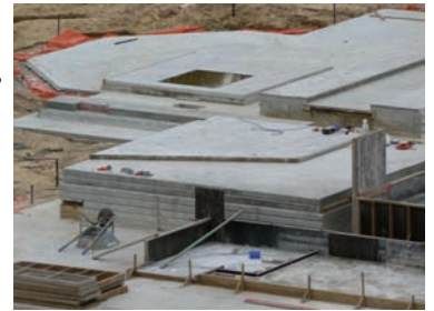
Panels piling up

Within the month the building will be taking shape.