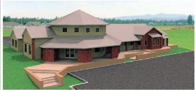
The proposed building in relation to the retaining wall

After the panels are stood the gap between the present slabs will be in-filled and only then will the other floor slabs be poured.