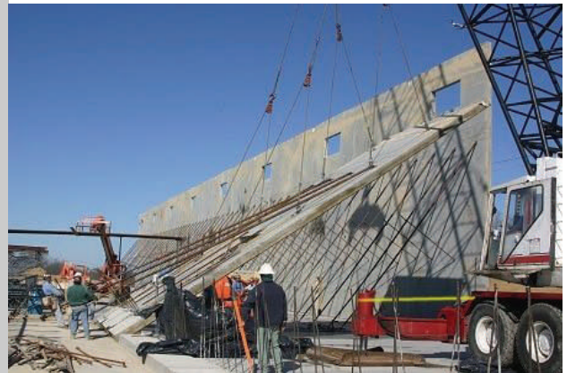
An example of a tilt up panel being raised into place